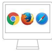
PC and Mac Chrome | Firefox | Safari